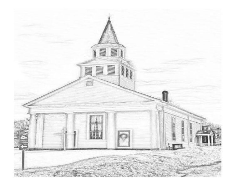
United Methodist Church of Bolton